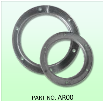
PART NO. AR00