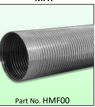
ALL HOSE DIAMETER IS I.D.

Standard length(s) 5 ft, 10 ft, 25 ft Increments. Larger diameters available . Special crating required on 10 ft or longer pieces, 5" diameter & up